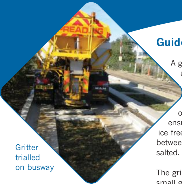
Gritter trialled on busway