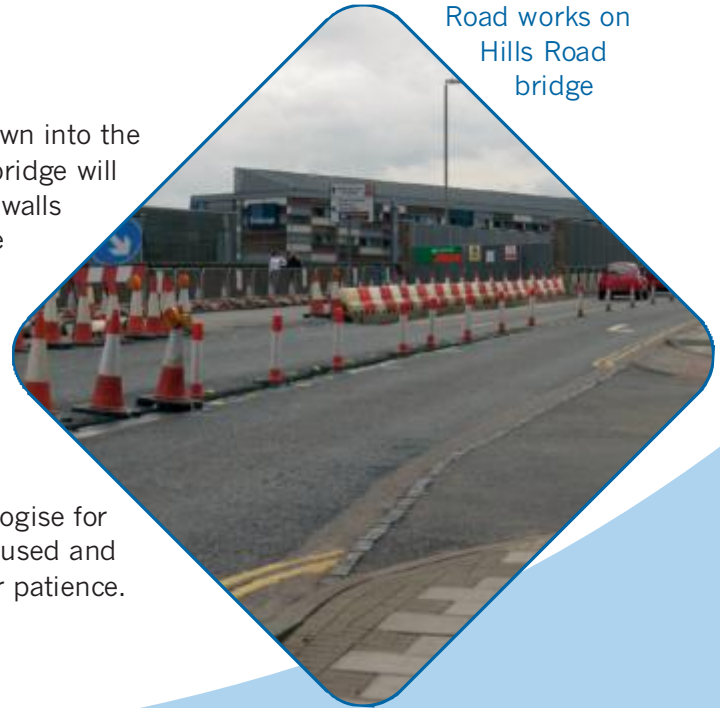
Road works on Hills Road bridge

We would like to apologise for any inconvenience caused and thank people for their patience.